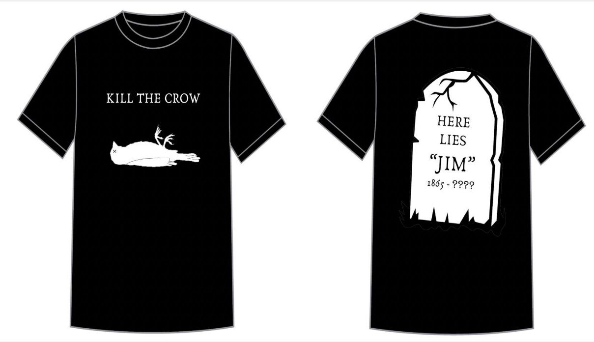
FIGURE 2: T-shirt mock up questioning whether the effects of Jim Crow Laws are still present today

We began our design process by trying to create shirt designs that would address a certain racial issues.