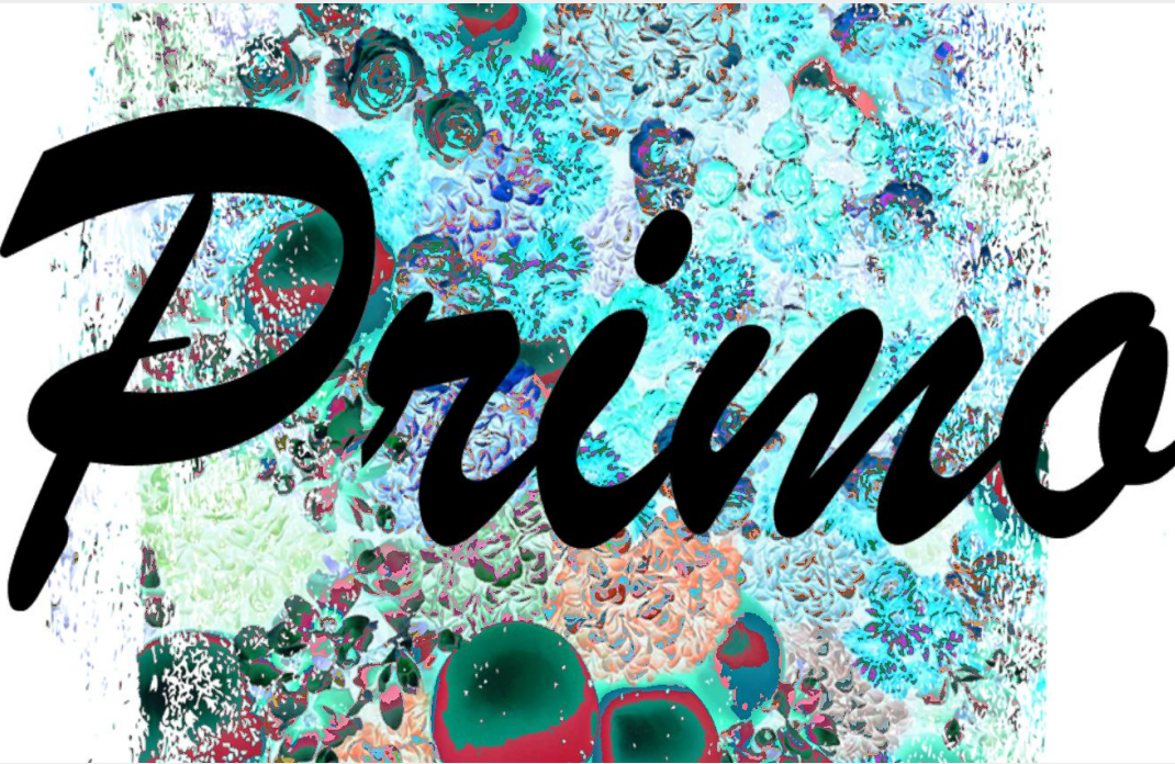
FIGURE 4: Early logo concept for our brand