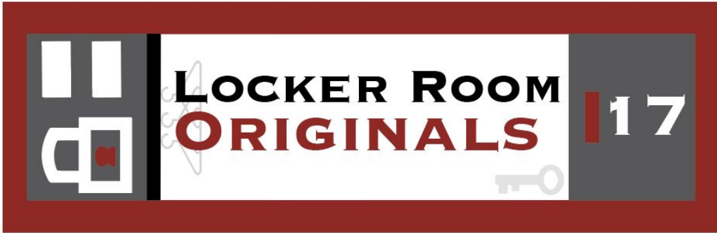
FIGURE 3: Logo concept for Locker Room Originals

As we move on to college, we plan on taking business classes throughout our 4 years in order to gain more knowledge and experience in the field. We hope to continue developing PRIMO and plan to use our new knowledge to fully launch the brand. Our goals for the future are to partner with local artists and screen printing companies along with prototyping and launching new lines, which we will begin to work on as a part of our Career Internship Experiences(CIE) project.